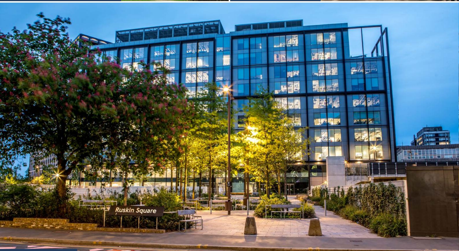
1 RUSKIN SQUARE