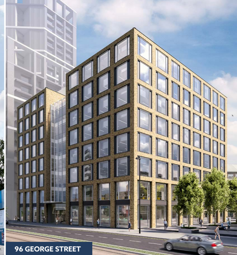
96 GEORGE STREET