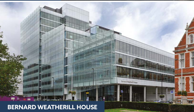
BERNARD WEATHERILL HOUSE