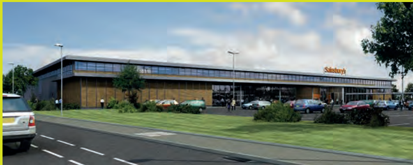
A new Sainsbury's Food Store is scheduled to open in 2016