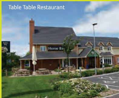
Table Table Restaurant